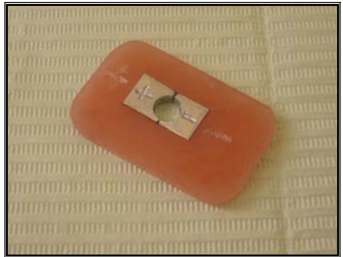
Figure 1. Composite matrix used in this study.

Eighty composite specimens were prepared forming 8 experimental groups (G1-G8) (n=10) of each composite type selected respectively.