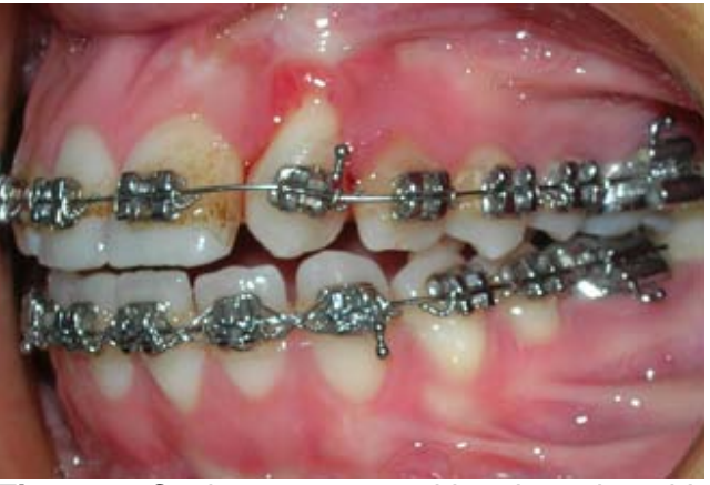
Figure 4. Canine was erupted into lateral tooth's position.

We began the treatment of the patient by extracting retained deciduous canine tooth. In order to make transposed and impacted canine tooth erupt, firstly 0.018 x 0.022 inch fixed Roth Edgewise appliances were applied. After the leveling, lateral tooth was moved into the space of the canine tooth and the space was obtained in the arch for canine tooth. Then, eruption appliance was placed surgically to the canine tooth. After the canine tooth erupted completely (Figure 4), it was grinded to make it look like a lateral tooth and the aesthetic of the canine was provided by applying connective tissue graft. As a consequence of the treatment, the patient has had pleasing aesthetic and smile (Figures 5,6,7). In 14-month follow-up; the patient's occlusion was stable, oral hygiene was adequate, and the patient was satisfied with the aesthetic results (Figure 8).