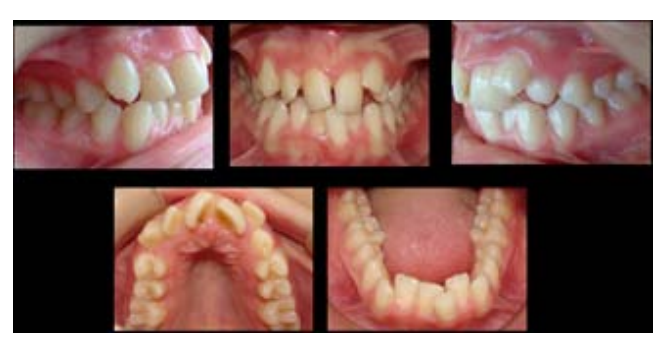
Figure 1. Pretreatment intraoral photographs.

A 14-year-old girl was referred to the Dicle University Faculty of Dentistry, Department of Orthodontics with a chief complaint of crowding. The patient was in good general health, and the medical and dental history indicated no contraindications to dental treatment. A clinical and oral examination showed severe crowding, retained deciduous canine tooth and dental Angle Class I (Figures 1,2). Impacted and transposed canine tooth was observed in the radiographic examination (Figure 3). In lateral cephalometric evaluations, skeletal Class I relation (ANB: 2°) was detected.