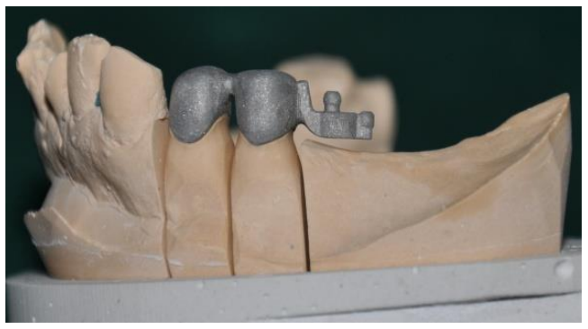
Figure 3. Attachment male part.