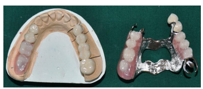
Figure 10. FPD and Finished dentures.