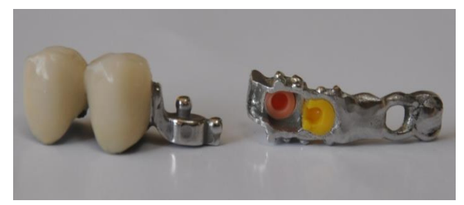
Figure 7. Male part and intaglio surface of female part.

After insertion of the removable denture they were evaluated intraorally and adjusted [Figure-11].