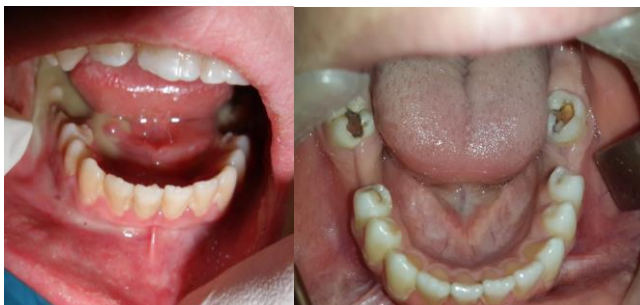
Figure 2a Figure 2b Figure 2a-2b. Intraoral Preoperative and Postoperative

During the intraoral examination, floor of mouth induration caused elevation of the tongue and floor of mouth was palpated that filling with the purulent matter (Figure 2a).