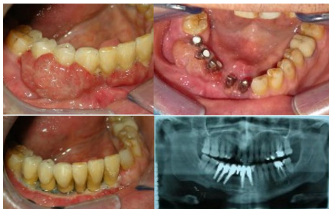
Figure 1. Intraoral view of lesion's behavior.

A 58-year-old male presented ameloblastoma of the mandible on the right side. A free vascularized iliac crest flap was used to reconstruct the missing bone. Eight months after surgery, 5 implants (Biomet3I LLC®) were placed on the vascularized flap. During various phases of work, the patient was rehabilitated with a provisional acrylic restoration cemented on the provisional abutment. Quick onset of gingival hyperplasia around the implants was observed.