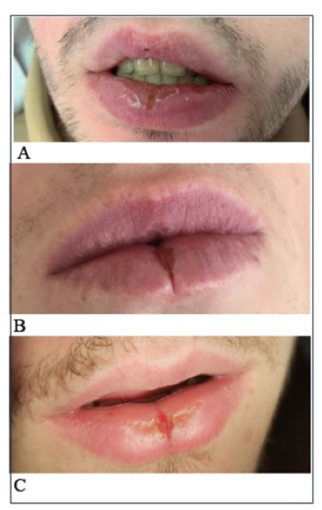
Figure 1. Clinical characteristics observed in chronic lip fissure (CLF). A. Mild CLF B. Moderate CLF C. Severe CLF.

Improvement and epithelialization of defects after therapeutic treatment alternated exacerbations, predominantly occurring during the autumn-winter period. Chronic fissure was observed in the lower lip area (n=10; 90.9%) and in 1 case (9.1%) in the upper lip area. The crack was predominantly located in the central region (n=10; 90.9%), with only one case exhibiting an eccentric location (n=1; 9.1%). Among all cases of chronic lip fissure, 3 cases (27.3%) were classified as mild, 6 cases (54.5%) as moderate, and 2 cases (18.2%) as severe. The most typical clinical findings of chronic lip fissure are presented in Fig. 1.