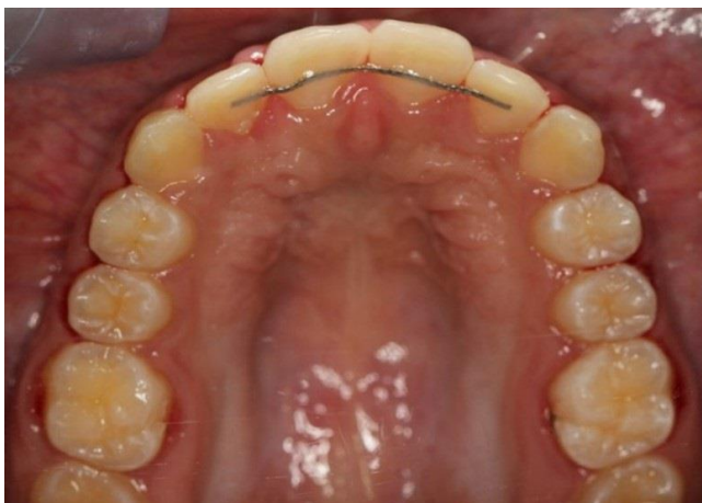
Figure 4. Patient status at the last follow up visit.