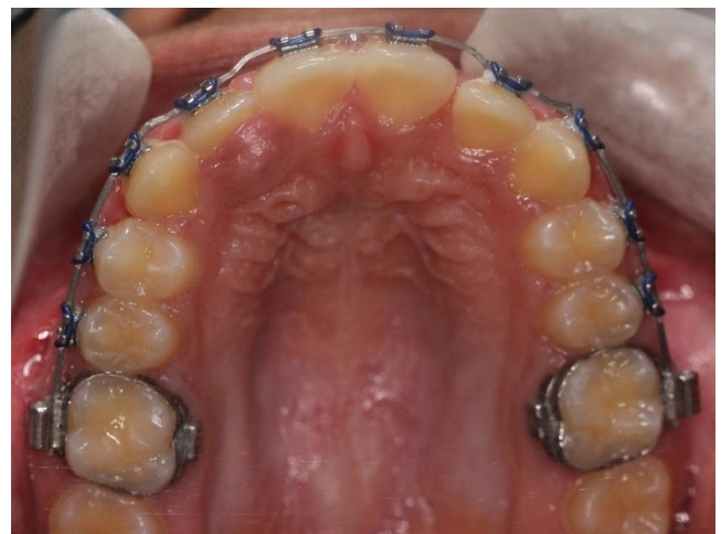
Figure 1. Swelling palatal to upper right lateral incisor tooth.

excision of the lesion, peripheral nature of the lesion could be noticed. The histological examination revealed a lesion that is sharply circumscribed with cystic features. The cystic wall is lined by a thin stratified squamous epithelium and a limited amount of stroma. The epithelial lining was seen exhibiting dentoid material that shows calcification and several ghost cells and some scattered osseous tissue (Fig. 2, Fig 3).