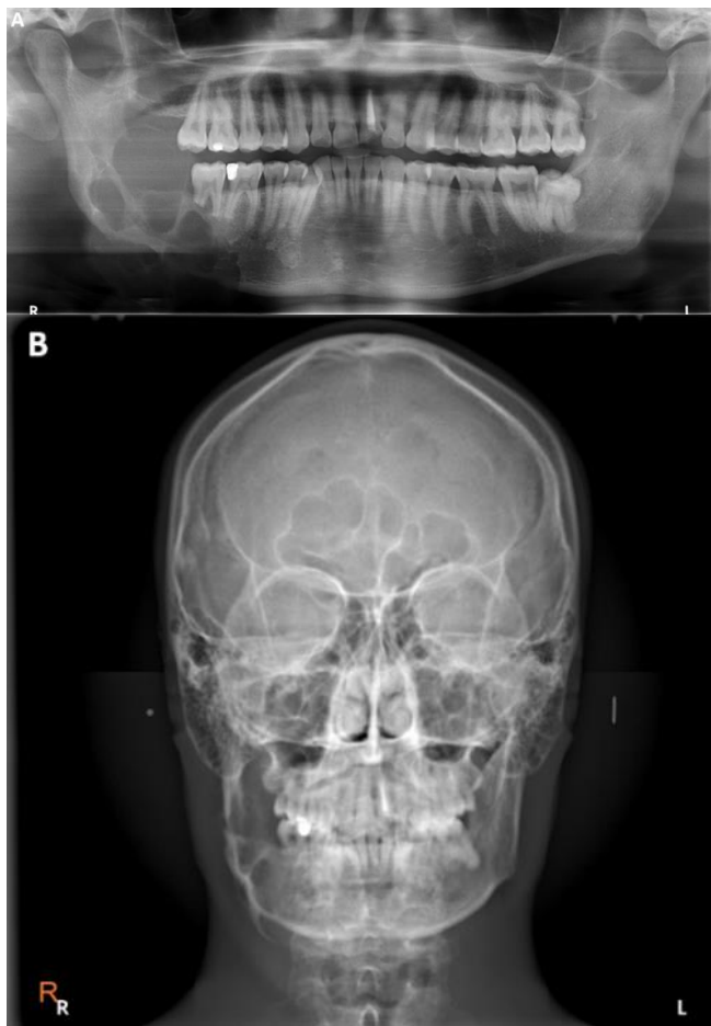
Figure 1. Pre-operative radiographs (A) Panoramic radiograph showed multilocular radiolucency at right posterior mandible involve inferior border of mandible. (B) Postero-anterior skull radiograph showed multilocular radiolucency with buccal expansion of right posterior mandible.

resection with segmental mandibulectomy and disarticulate then immediately reconstruction mandibular defect with Fibular microvascular flap. However, patient denied the flap reconstruction option due to complications and morbidity from complex procedures. Another reconstruction method was offered as 3D printing customized titanium mandibular prosthesis and condyle with a specialized housing design for autogenous iliac bone block graft. By comparing all risk and benefit, patient made his decision for the latter plan.